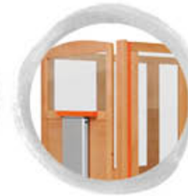
tube feed-through (gap version)