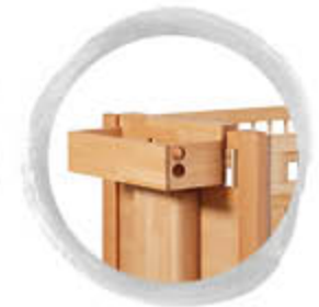
storage compartment with tube feed-through for hanging