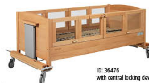
ID: 36476 with central locking device