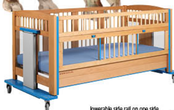
lowerable side rail on one side with 24 cm push-on element (standard)