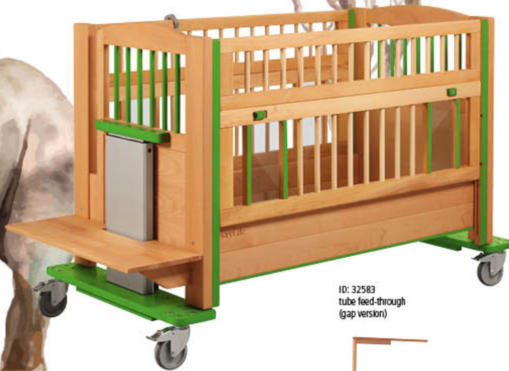
ID: 32583 tube feed-through (gap version)