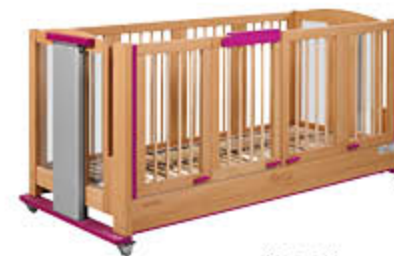
ID: 34214 tube feed-through (gap version)