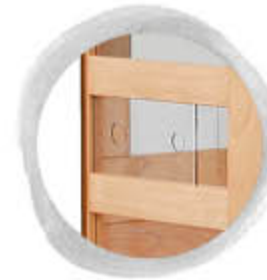
supply opening (hole) with closing mechanism

Our tube feed-through/supply opening is available in the following versions: