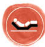
Head- & footelement manual or electric adjustment (option)