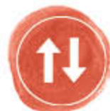
Electric height adjustment