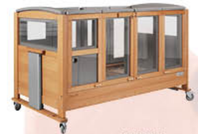
ID: 36496 supply opening (hole) with closing mechanism