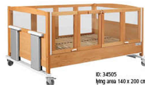
ID: 34505 lying area 140 x 200 cm