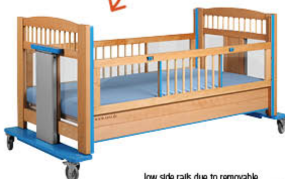
low side rails due to removable push-on element on both sides (option)