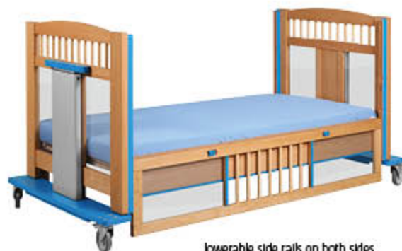
lowerable side rails on both sides (option)