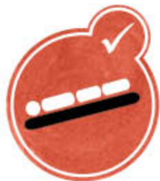
Trendelenburg- /Antitrendelenburg- function

Thanks to the four-winged folding sliding door, the barred sides and the flexible height and inclination adjustment possibilities, this bed provides very good therapeutic support.