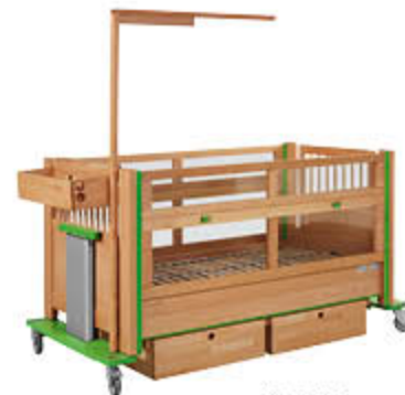
ID: 38446 storage compartment with tube feed-through for hanging