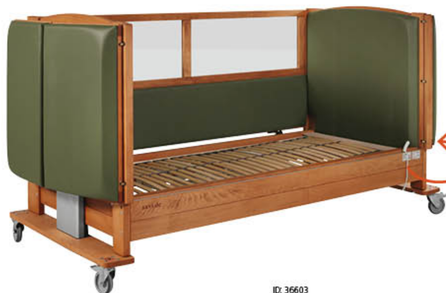
ID: 36603 wood colour 'Teak'