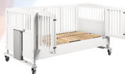
ID: 32973 white lacquered