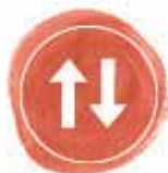
Electric height adjustment