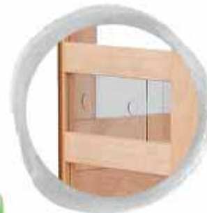
tubing with sliding perspex (recloseable)

Our tubing furnishing is available as follows: