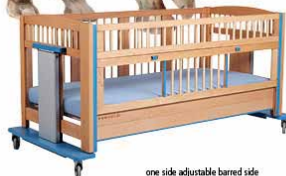
one side adjustable barred side with 24 cm push-on element (standard)