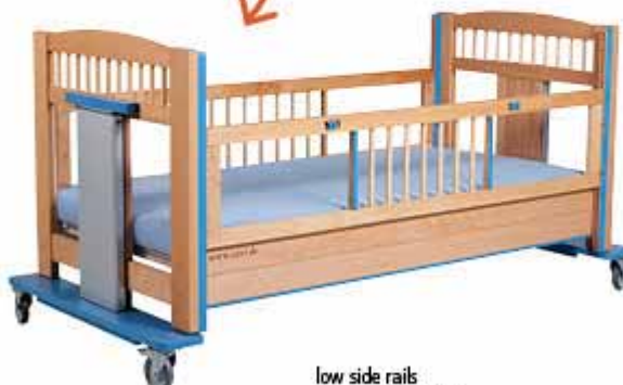
low side rails due to removable push-on element on both sides (option)