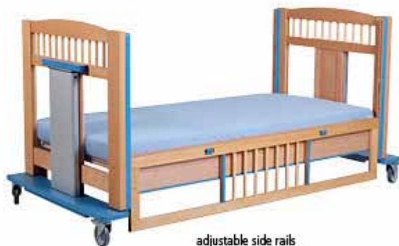
adjustable side rails on both sides (option)