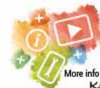
More info about Knut: www.savi.de/beds/knut