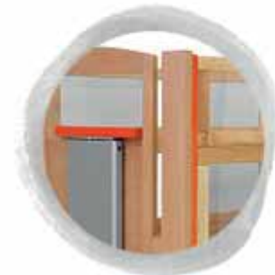
tubing on the middle foot element