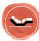
Head- & footelement manual or electric adjustment (option)