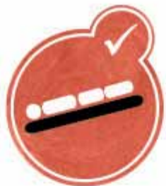
Trendelenburg- /Antitrendelenburg- function

Thanks to the four-winged folding sliding door, the barred sides and the flexible height and inclination adjustment possibilities, this bed provides very good therapeutic support.