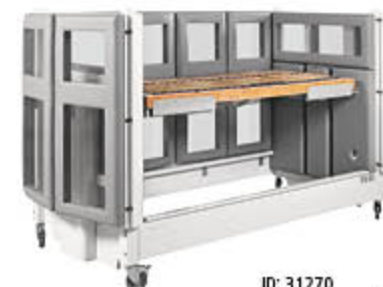
ID: 31270 White lacquered (opaque)