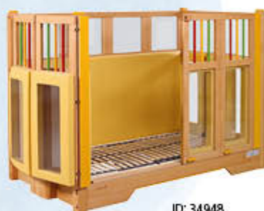
ID: 34948 Without castors, coloured sticks