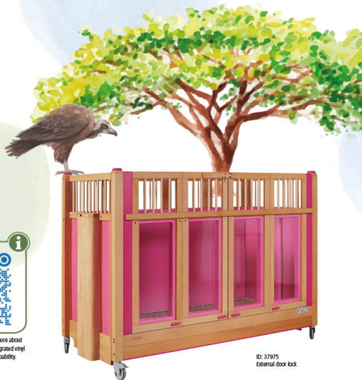
ID: 37975 External door lock

Scan the QR code to find out more about our fixed Skai-padding with integrated vinyl windows and its padding capability.