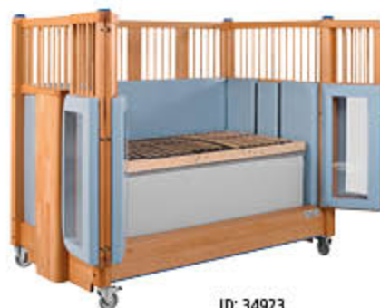
ID: 34923 Touch protection for height adjustment

"Sooo much space – I'd love to cuddle in it too!"