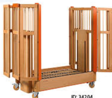
ID: 34204 Sticks, wooden castors and 270° door on both sides