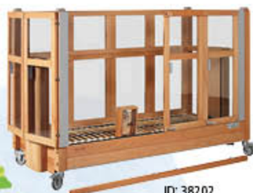
ID: 38202 Colour accent grey, lockable Handset-box, external lock