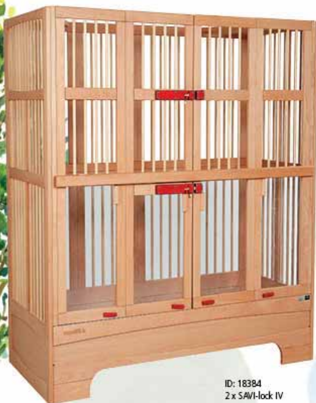
ID: 18384 2 x SAVI-lock IV