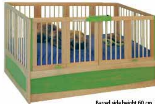
Barred side height 60 cm e.g. in green colour accent

All SAVI-locks available for even greater security