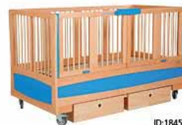
ID: 18454 drawers