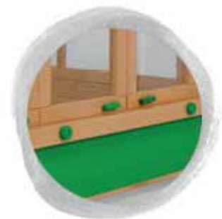
external lock on side of bed (option)