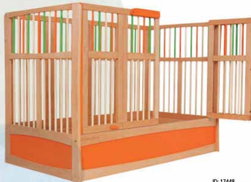
ID: 17448 coloured sticks