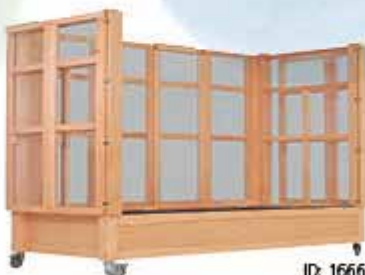
ID: 16662 all perspex