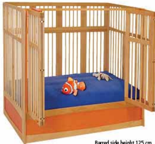
Barred side height 125 cm e.g. in orange colour accent