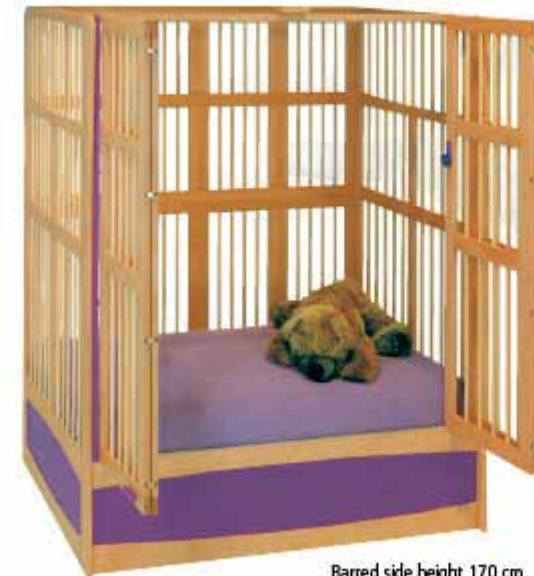
Barred side height 170 cm e.g. in blue-purple colour accent