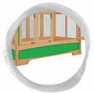
Height: 8 cm (other heights are possible, e.g. for use of patient lifts)