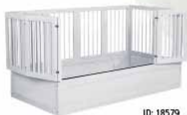
ID: 18579 stained white