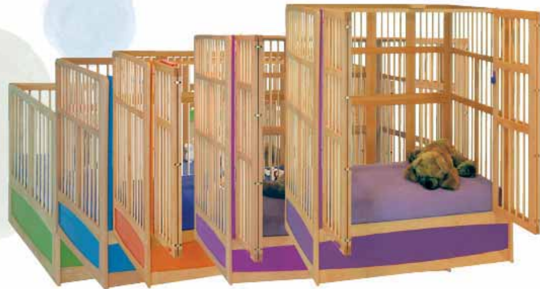
Total heights: 110 cm | 150 cm | 175 cm | 200 cm | 220 cm