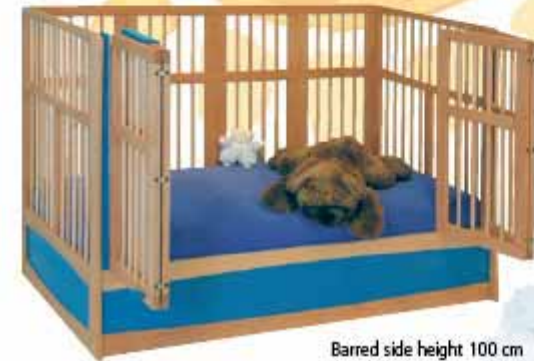
Barred side height 100 cm e.g. in blue colour accent