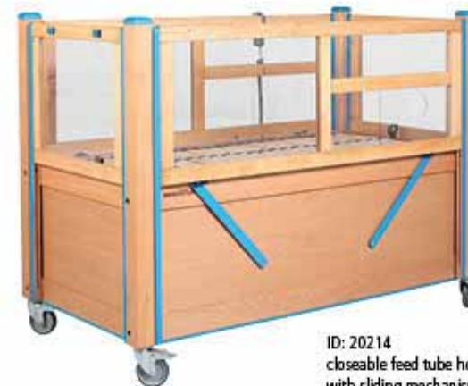
ID: 20214 closeable feed tube hole with sliding mechanism (reclosable)