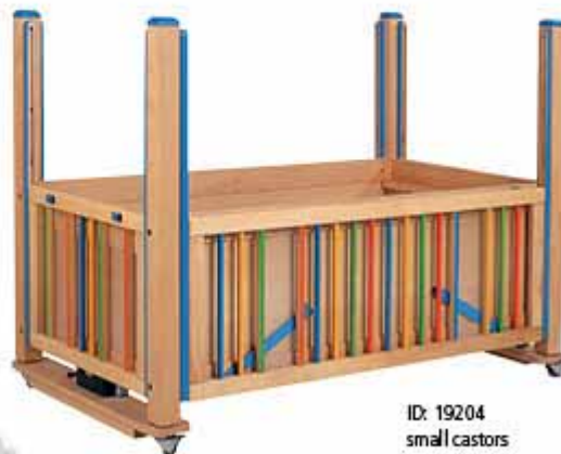
ID: 19204 small castors