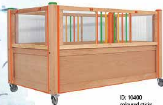
ID: 10400 coloured sticks