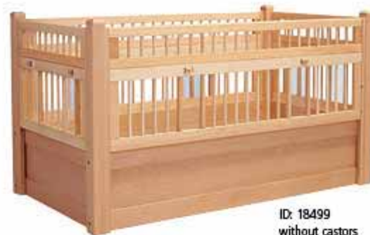
ID: 18499 without castors