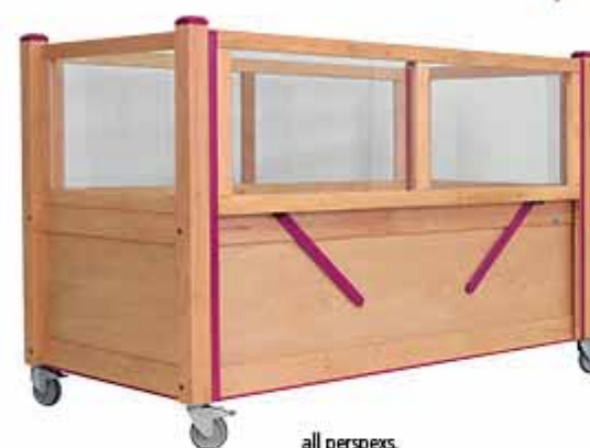
all perspex, e.g. with electrically adjustable sides in deep-purple colour accent