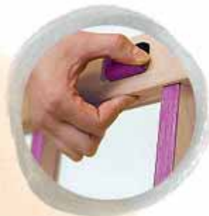
recessed safety grip (basic)