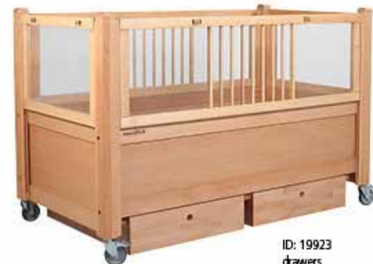
ID: 19923 drawers