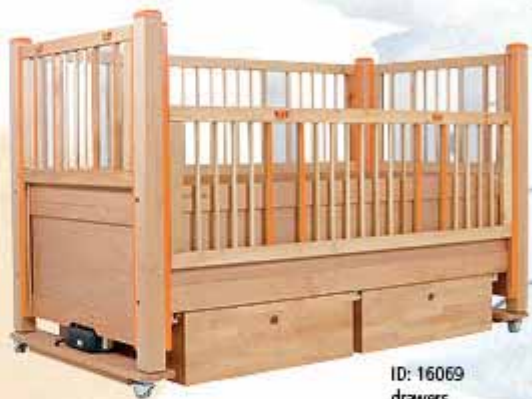
ID: 16069 drawers