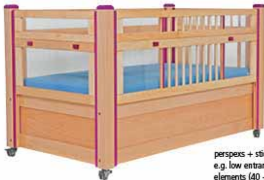
perspex + sticks, e.g. low entrance (47 - 87 cm) and two top elements (40 + 20 cm)