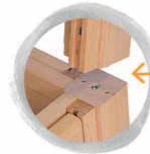
Removable corner posts