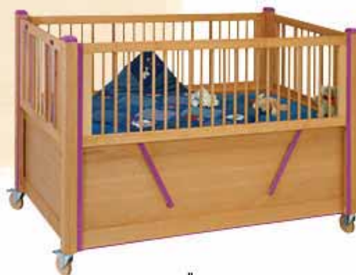
all perspex, e.g. with electrically adjustable sides in deep-purple colour accent