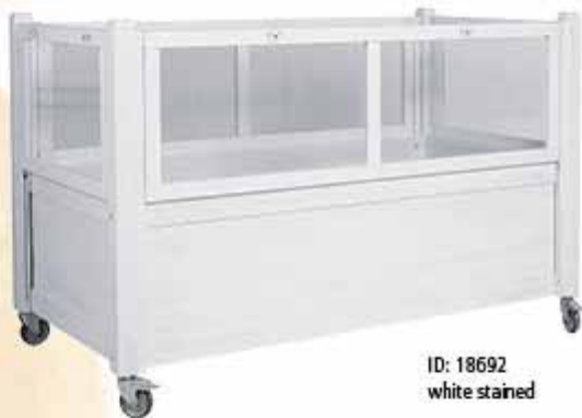
ID: 18692 white stained