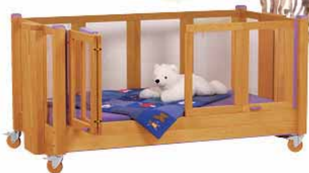
Barred side height 72 cm, e.g. in blue-purple colour accent with wooden castors

A lot of safety, even for particularly active children