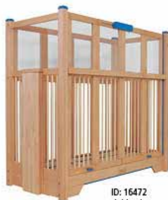
ID: 16472 children's name on side of bed