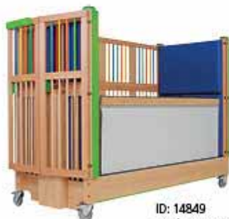
ID: 14849 touch protection for height adjustment