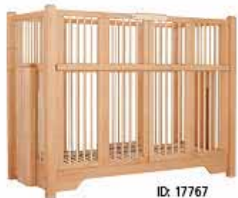
ID: 17767 all sticks