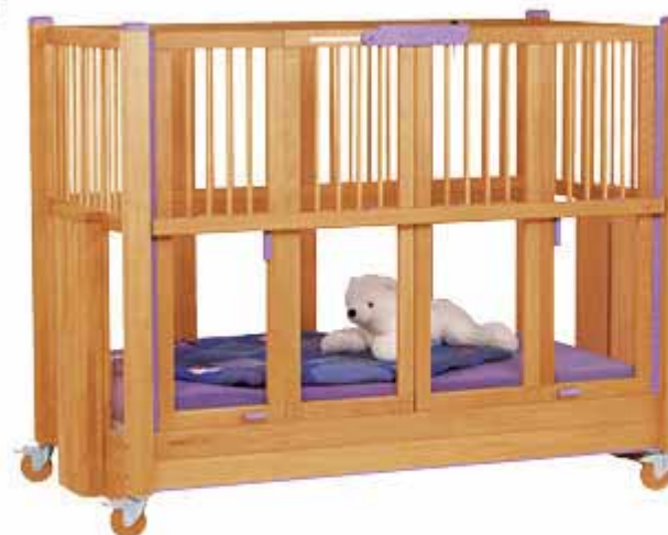
Barred side height 135 cm, e.g. in blue-purple colour accent with wooden castors