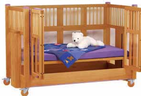
Barred side height 113 cm, e.g. in blue-purple colour accent with wooden castors