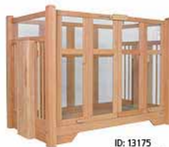
ID: 13175 low entrance height without castors