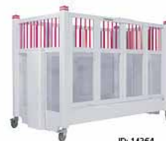
ID: 14364 white painted