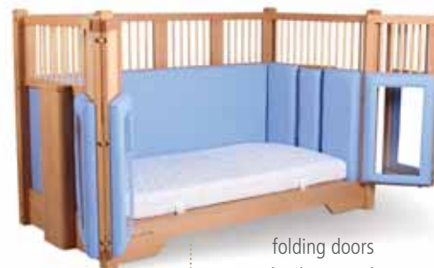
folding doors completely opened